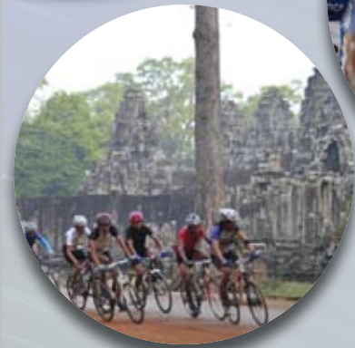
Run to bring artificial Limbs for land mines survivors and save youth from HIV/AIDS.

04 DEC.2011 RUNNING EVENTS 03 DEC.2011 CYCLING EVENTS